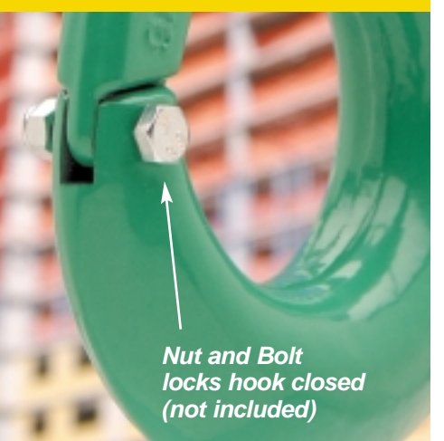
Nut and Bolt locks hook closed (not included)